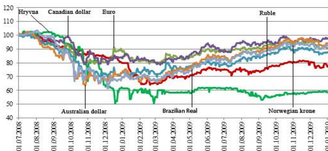
Fig. 1. The Movement of the Ruble's Foreign Exchange Rate in 2008–2009 against the National Currencies of Some Other Countries (1 July 2008 = 100)